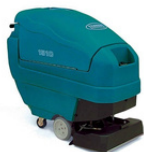
TE1510 CleaningPath:19in/ 482 mm